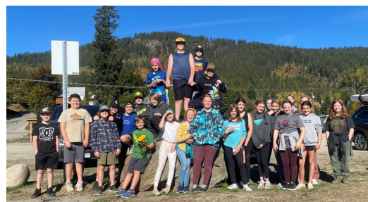
People, Plants and Pride Growing Together

The picture features the group that worked downtown. There were also some students that did clean-up and weeding at the cemetery, however we missed getting your picture, but we truly appreciate your hard work! Thank you all!