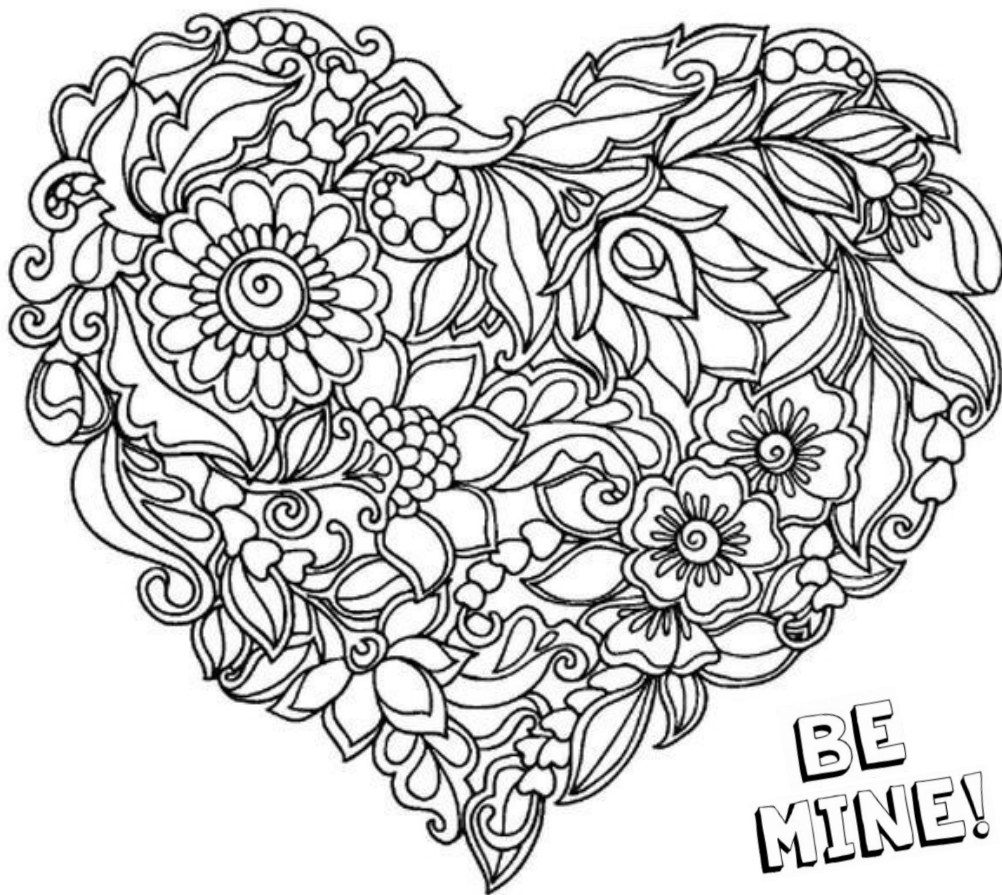
Valentine Colouring Fun